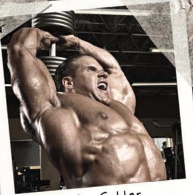
Subject: Jay Cutler Observations: Effortless 120-lb. dumbell extensions.

...e beast with unimaginable power can be summoned with the emergence of nano Vapor™ — the ultimate anabolic psychoactive experience.