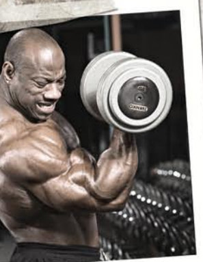
Subject: Dexter Jackson Observations: Hypertrophic actions triggering rapid expansion.

psychological control centers. The psychoactive signaling intensity catalyst, NeuroAMP™, detonates a neurological storm that travels down axons and across synapses to invigorate your cells with a blast of unimaginable firepower. The weight feels light as you tear it off the rack and start firing up reps like a man possessed. Compounding with this focused surge of power is the lipid inferno fusion — Infernogen™. As a synergistic component of the nano Vapor